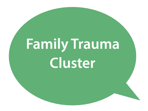
Figure 1: Media Clusters